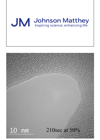
Final step of cleaning progression

The Bridge, a leading research hub at the University of Lincoln, collaborates with industry partners to advance materials science and engineering solutions. Recognising the need for precise and reliable sample preparation, The Bridge chose Henniker Plasma's HPT-100 TEM Plasma Cleaner to enhance their electron microscopy capabilities.